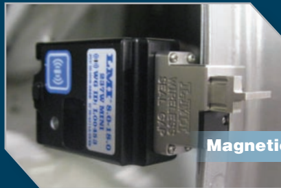
LMI 237W Mini Door Seal Gap Gauge