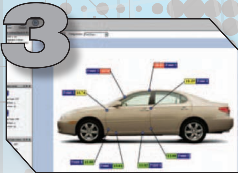
STEP THREE View and sample live readings on a colorful graphics screen to verify part quality