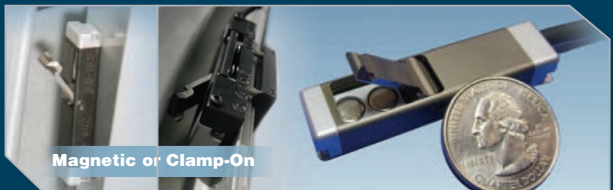
Magnetic or Clamp-On