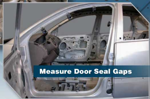
Measure Door Seal Gaps