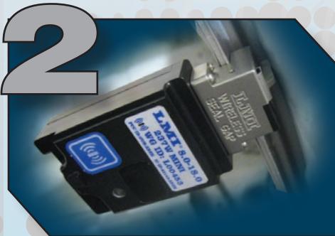
STEP TWO Close and flush door or deck lid.