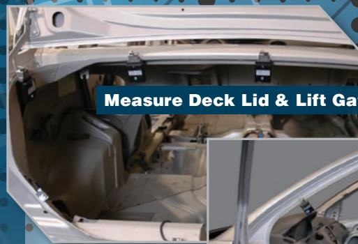
Measure Deck Lid & Lift Gate Seal Gaps