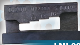
LMI 2303 Verification Block