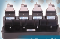
4 Port Charger