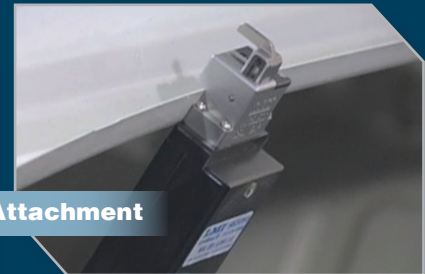
LMI 238W Mini Deck Lid Seal Gap Gauge